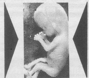
YOUR ACTUAL SIZE AT TWO MONTHS

Look again at the picture. Do you think you were anything but a human being when you looked like this?