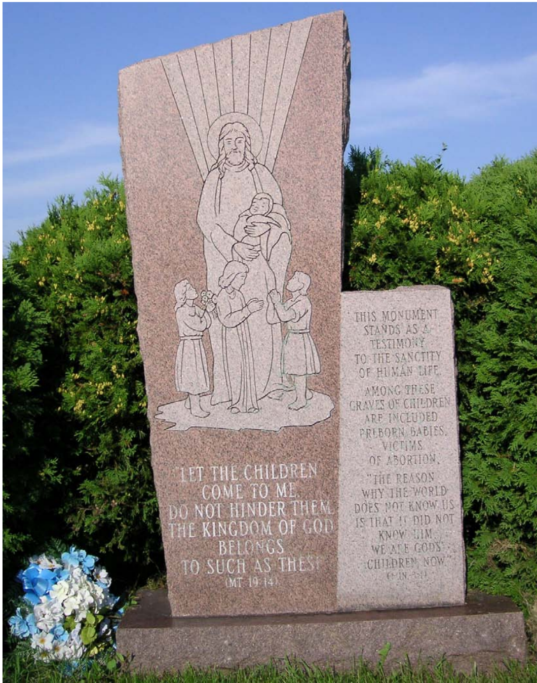
Monument dedicated to the Sanctity of Human Life to draw attention to the nearby graves of unborn children killed by abortion, children's section of Holy Cross Cemetery, Milwaukee, Wisconsin