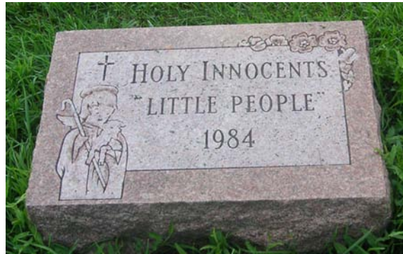
“Little People” gravestone