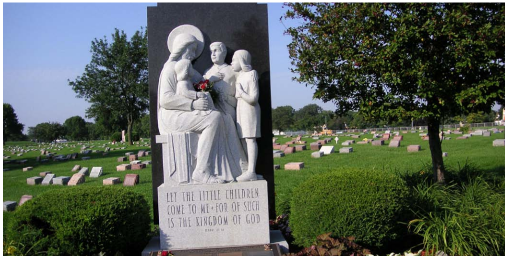
Monument at the corner of the children’s section of Holy Cross Cemetery

NOTE: For those wishing to visit and pray at these graves, the children’s section of Holy Cross Cemetery is located in the northwest part of the cemetery, just south of the administration building. The cemetery’s address is: 7301 W. Nash St., Milwaukee, Wisconsin 53216.