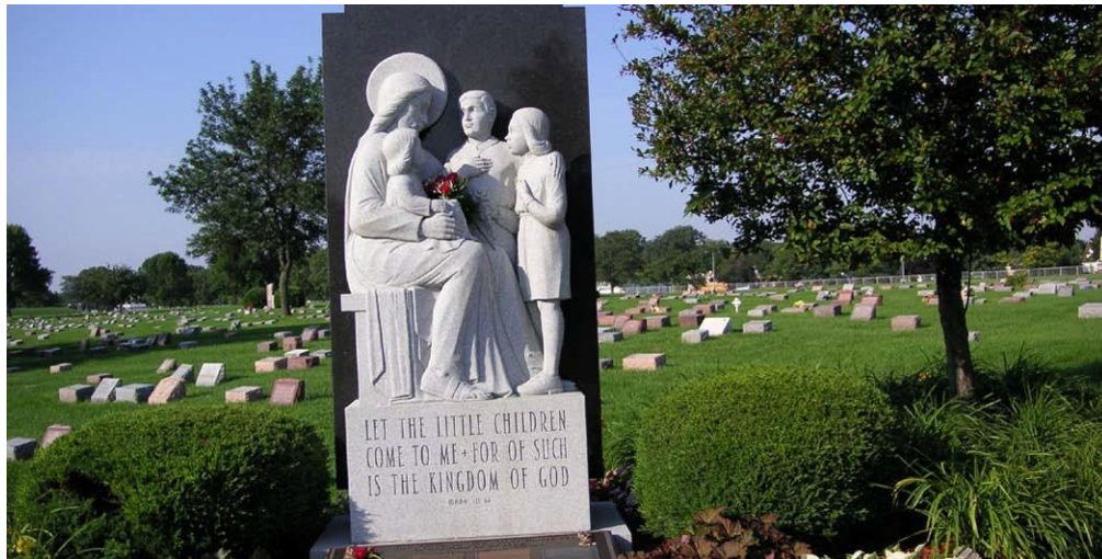
Monument at the corner of the children's section of Holy Cross Cemetery

NOTE: For those wishing to visit and pray at these graves, the children's section of Holy Cross Cemetery is located in the northwest part of the cemetery, just south of the administration building. The cemetery's address is: 7301 W. Nash St., Milwaukee, Wisconsin 53216.